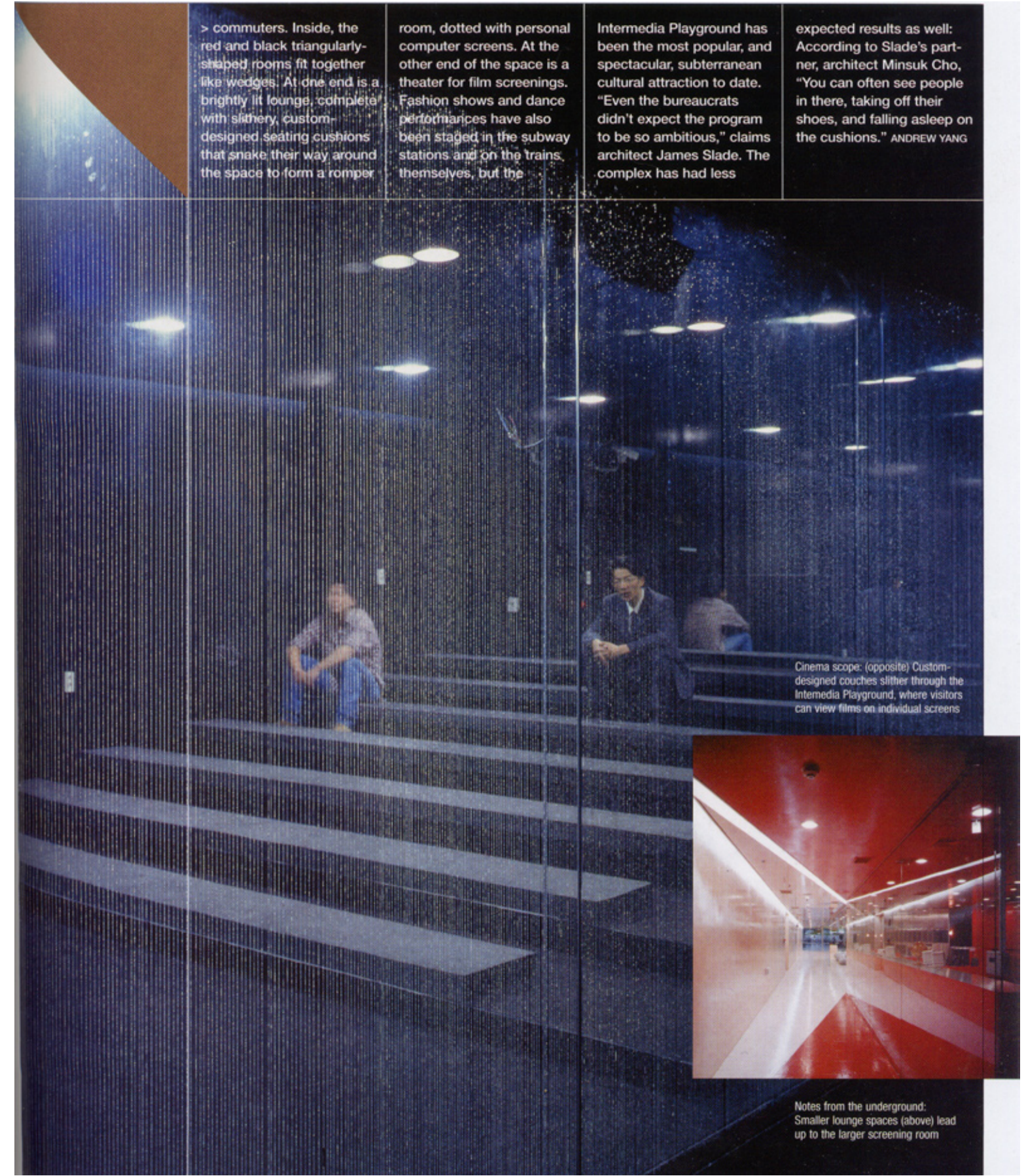
Cinema scope: (opposite) Custom-designed couches slither through the Intermedia Playground, where visitors can view films on individual screens

expected results as well: According to Slade's partner, architect Minsuk Cho, "You can often see people in there, taking off their shoes, and falling asleep on the cushions." ANDREW YANG