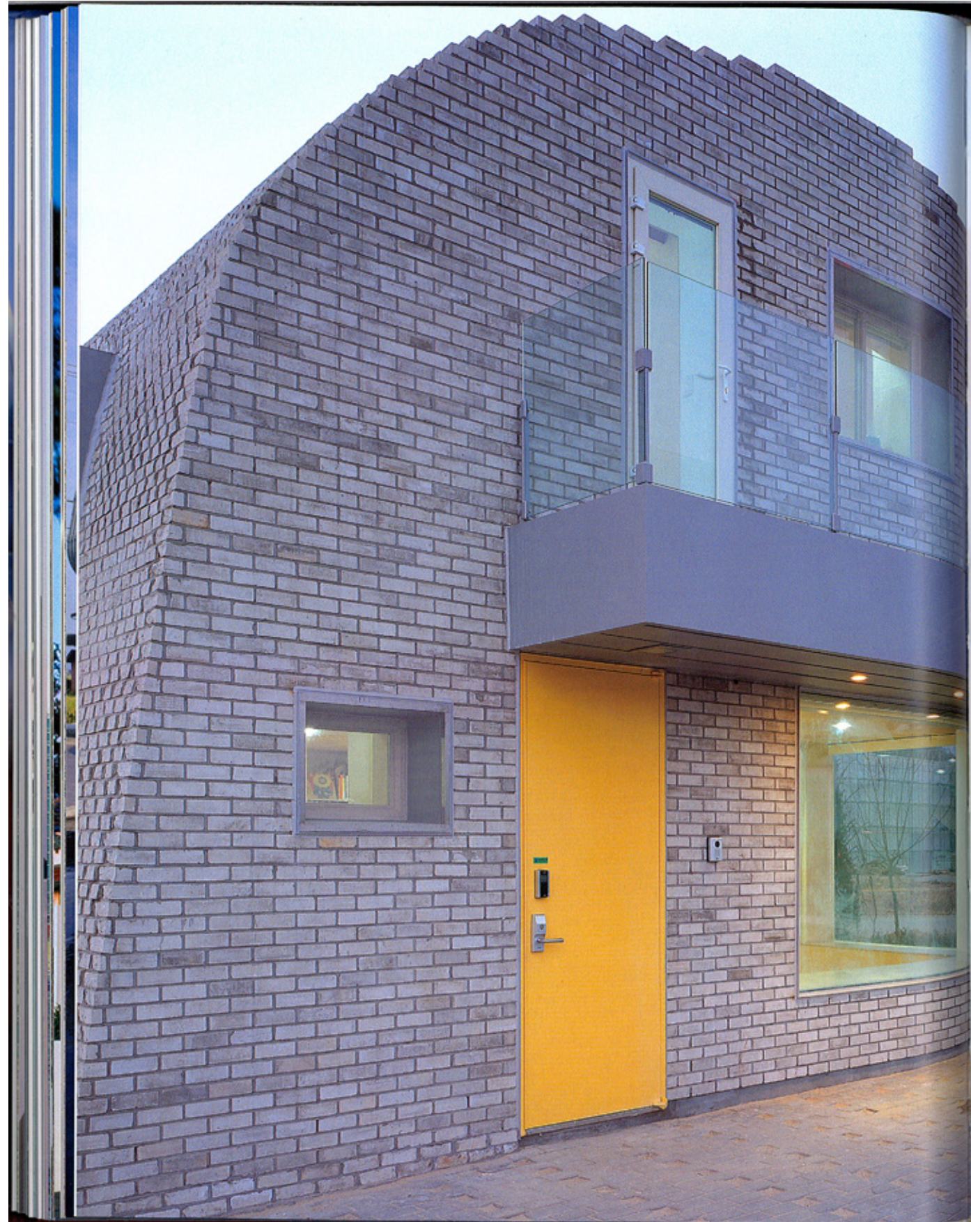
SLADE ARCHITECTURE | NEW YORK MASS STUDIES | SEOUL PIXEL HOUSE Heyri, South Korea | 2001