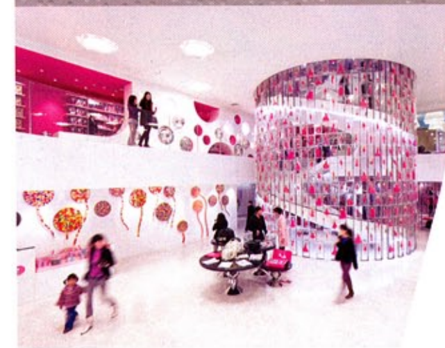
HOUSE OF BARBIE, SHANGHAI SLADE ARCHITECTURE